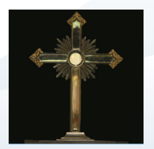
I wait for you

the office to request an access card. If you are an individual who likes to drop in and visit with Jesus in the middle of the night please call the church office and obtain your card for entry.