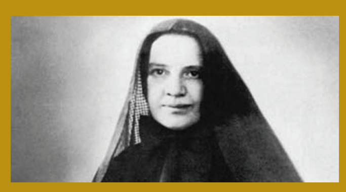
immigrant children and the poor with Catholic values, education and health care.

The call she felt from God was strong, but it was fulfilling the needs of the world that gave her life meaning. She was ultimately responsible for the creation of hundreds of hospitals and schools that catered to the needs of