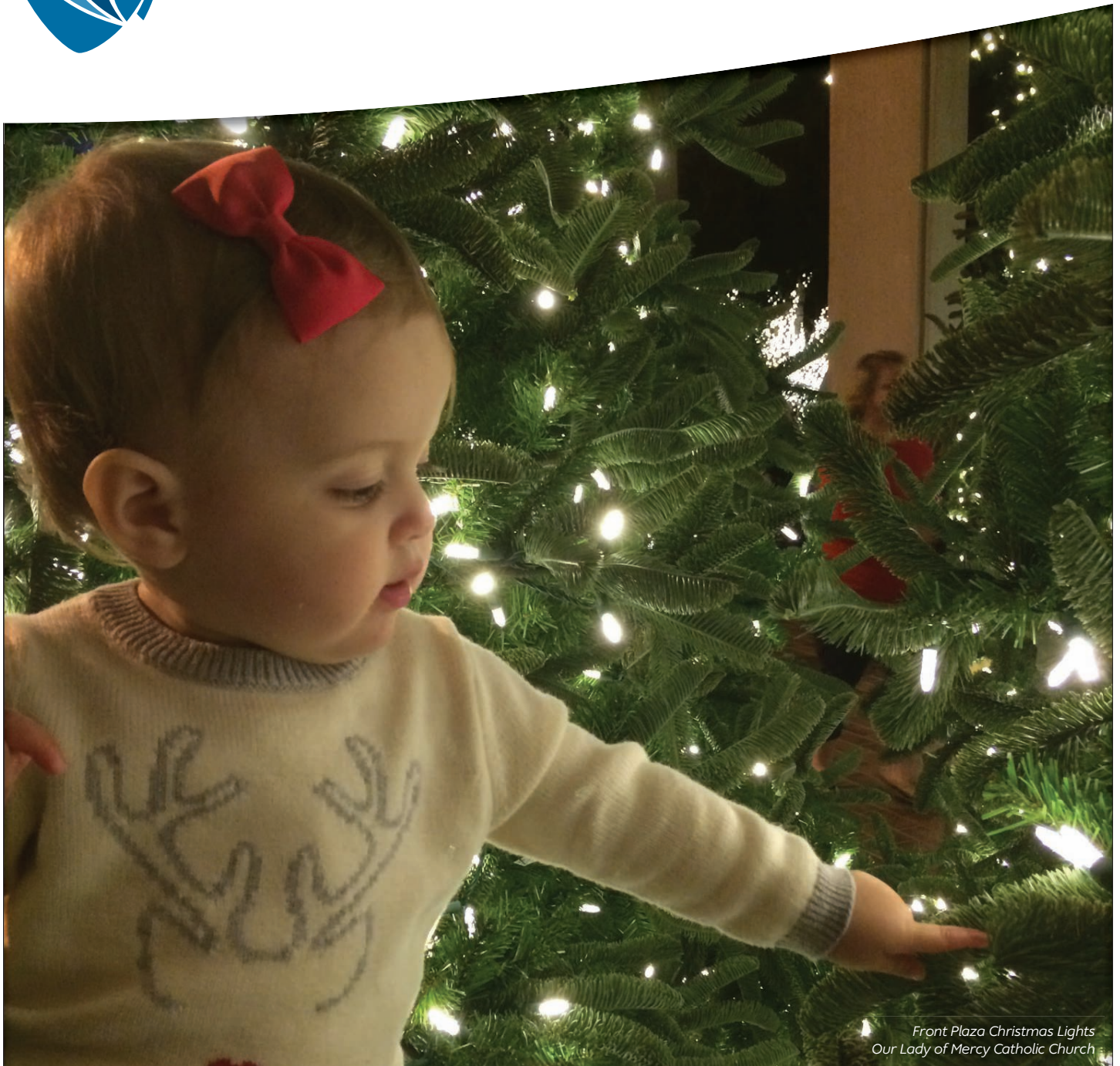
Front Plaza Christmas Lights Our Lady of Mercy Catholic Church

“The brightness of God illumined the holy city Jerusalem and the nations will walk by its light.”