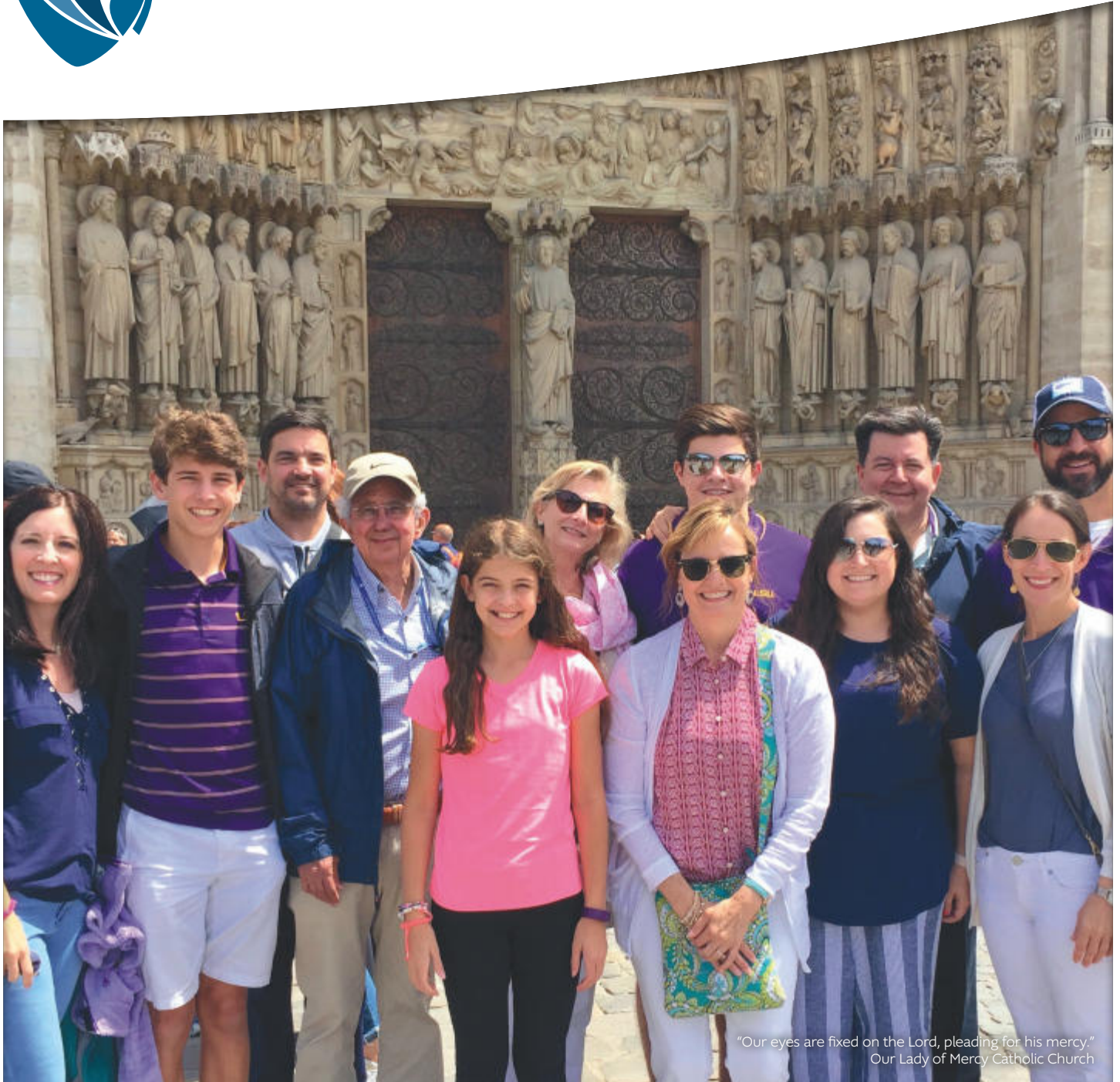
"Our eyes are fixed on the Lord, pleading for his mercy." Our Lady of Mercy Catholic Church

JULY 8, 2018 XIV SUNDAY IN ORDINARY TIME VOL. 41 NO. 27